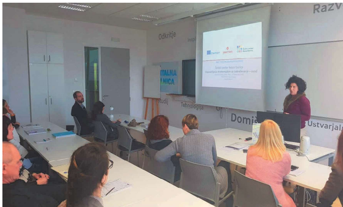
PEERMENT Training session in Slovenia