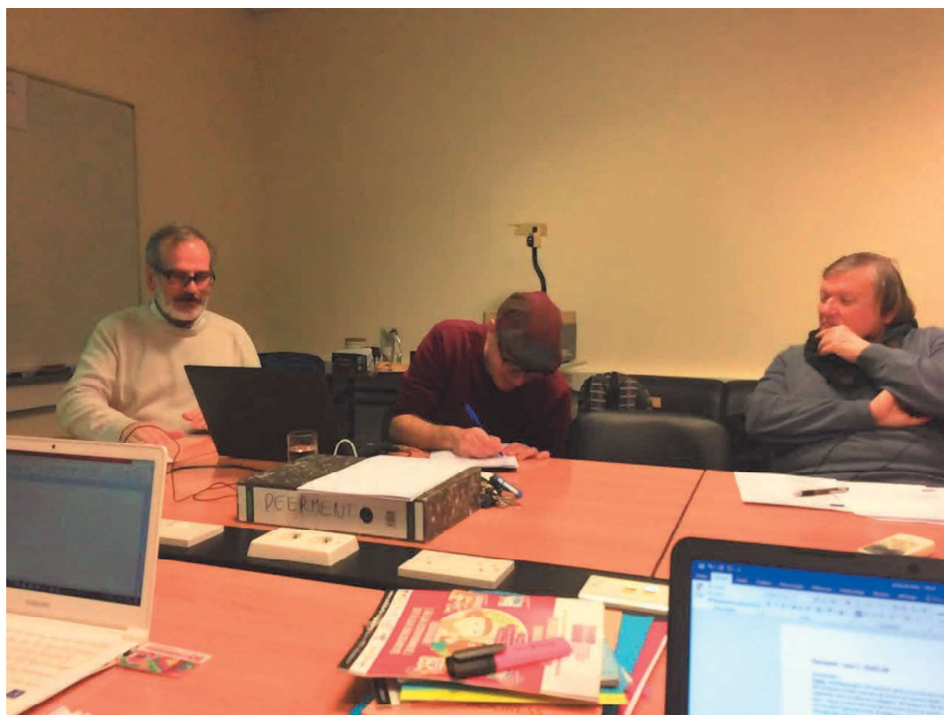
Planning PEERMENT together