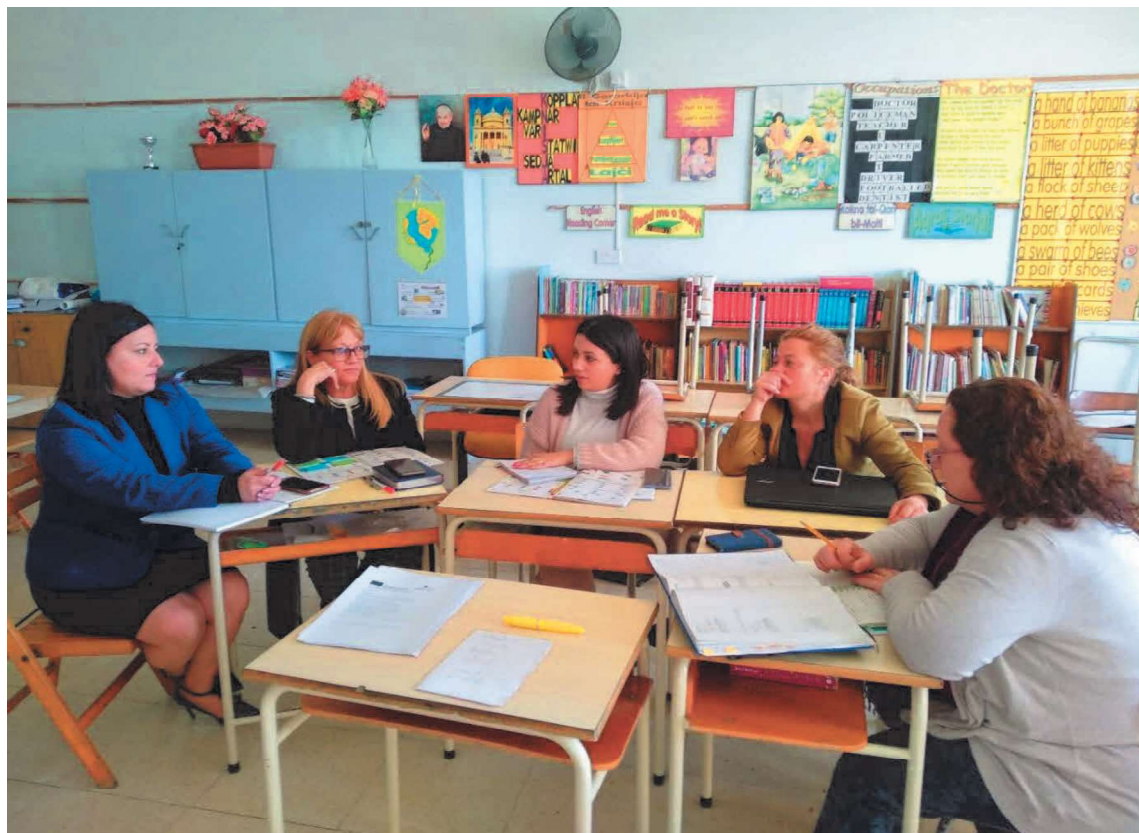
A Local Training Group meeting in Malta

and flexibility of choice according to context adopted by PEERMENT allows for inclusion of such an approach, although teachers did deplore that sometimes they lack the means to act on such aspects.