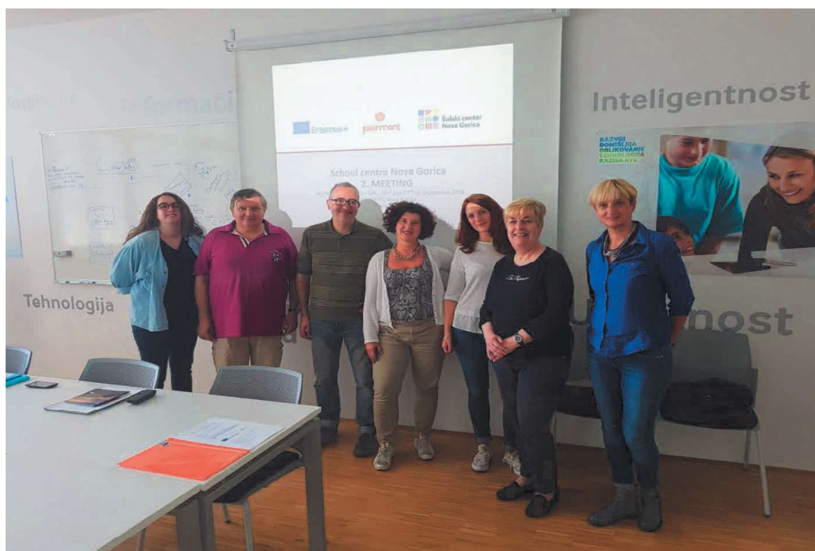
The PEERMENT Scientific Committee during one of their meetings

widening its inequalities. To avoid this possibility, young people need to receive a critical thinking and solution-oriented training that only quality education can provide. PEERMENT's methodology perfectly fits this idea. Teachers, who created WebQuests in the Local Teacher's PEERMENT Group , challenge their students to develop these competences through this solution-oriented inquiry methodology. This new forma mentis will help them in the comprehension of the challenges of the interconnected world of today and will give them the basic tool to be able to contribute to a future of equal, inclusive and sustainable societies. The PEERMENT approach together with the WebQuest tool, correctly used inside the school context, could become an efficient methodology capable of helping the next generation in accomplishing the difficult challenges they will face.