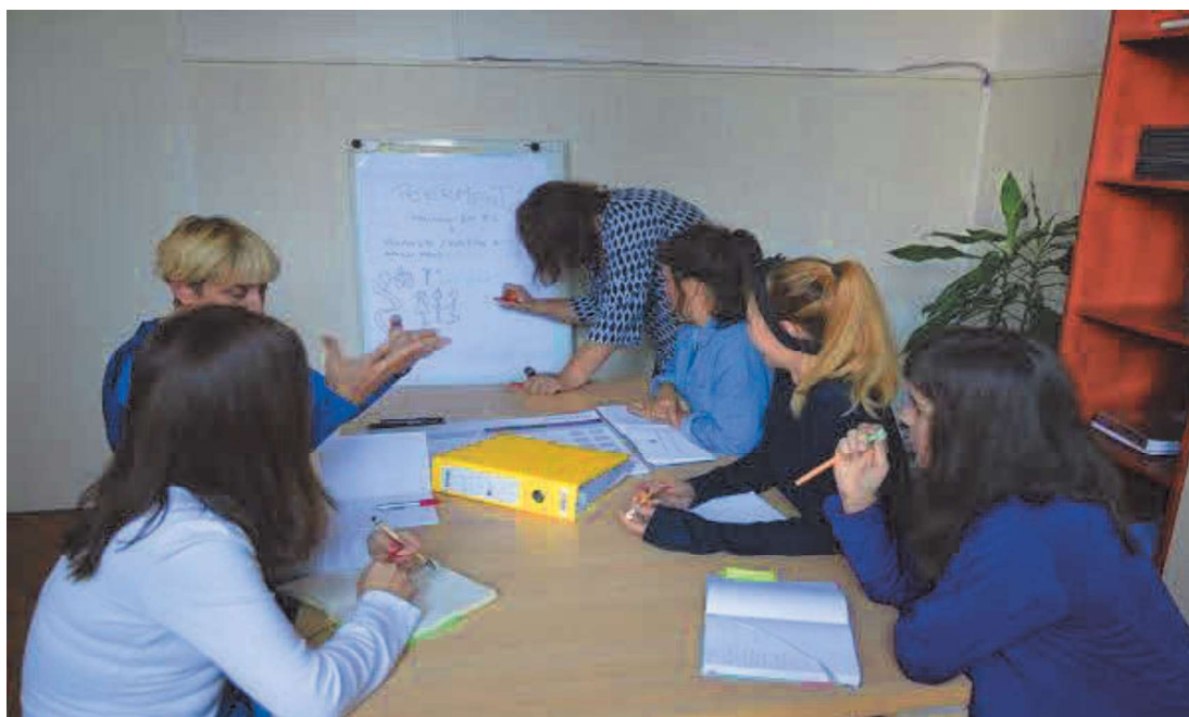
PEERMENT Training session in Croatia

Teachers tested the elaborated their new lesson plans and WebQuests with their students.